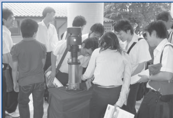
A large number of engineering students paid attention to one of booths in the mini HVAC&R exhibition.

There was a favorable feedback from student, visitors and participating dealers such as; "I like this event. It opens my eyes and my mind. I have never seen the internal sectional-cutaway of that kind of rotating machineries like that before" ,one of students said. Other feedback from a company representative was "I can make new contacts from other companies and advertise my company to new generation engineers also."