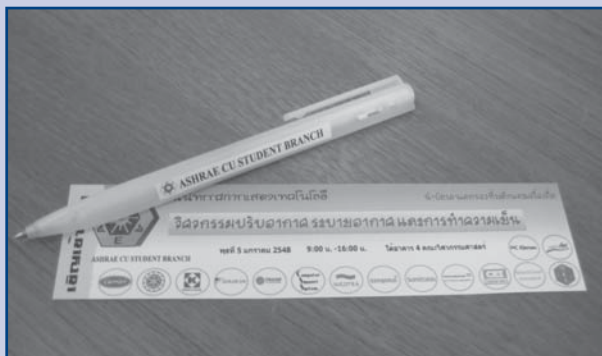
An inviting card and a gift for visitors.

There was a favorable feedback from student, visitors and participating dealers such as; "I like this event. It opens my eyes and my mind. I have never seen the internal sectional-cutaway of that kind of rotating machineries like that before" ,one of students said. Other feedback from a company representative was "I can make new contacts from other companies and advertise my company to new generation engineers also."