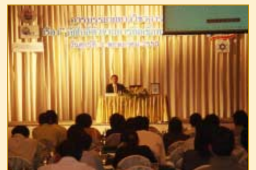
May 4, 2007: Seminar topics "Dangerous from Airborne infection and disease" at The Grand Hotel, Ball room