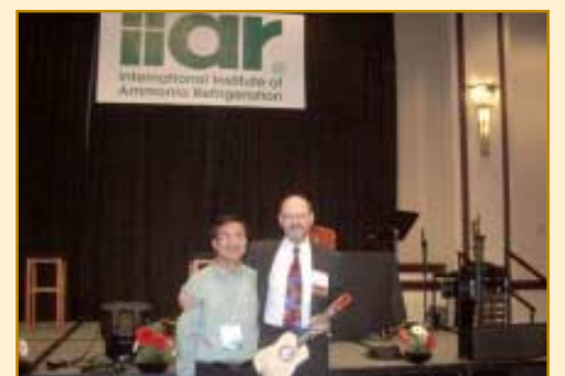
March 19-20, 2007: Participated in IAR 2007 Ammonia Refrigeration and Trade Show at the Renaissance Hotel in downtown Nashville, Tennessee, USA.