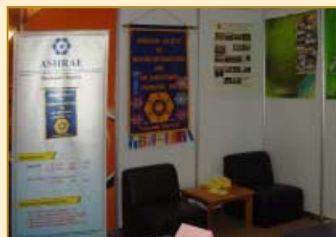
March 8-10, 2007: Seminar "The Energy Series 2007" at Queen Sirikit National Convention Center, Bangkok.