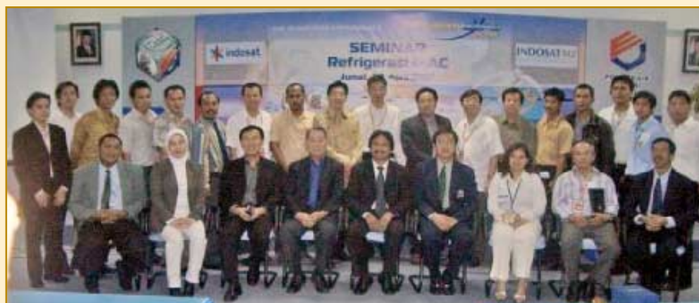
April 20, 2007: Participated in Polban Expo in Bandung, Indonesia.