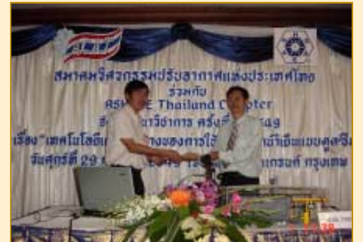
September 29, 2006: ASHRAE Thailand Chapter set seminar on topic "Direction and Absorption chiller technology" at The Grand Hotel, Chao Sam Pra-ya room.