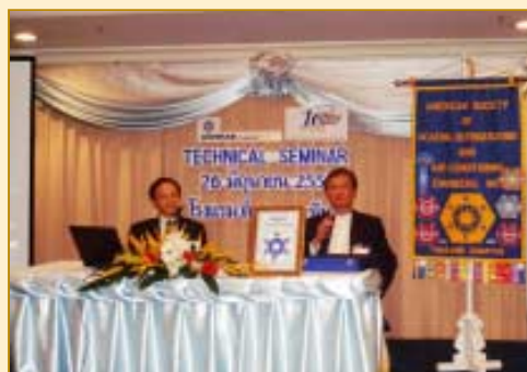
June 26, 2007: Seminar topic "How to make the Sustainable Building: Learning from the experience of the practitioners".