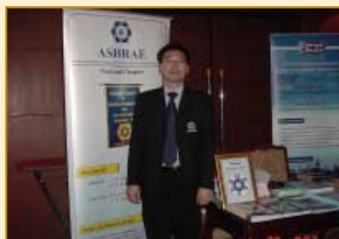
February 20, 2007: Carrier's seminar "The Chillers 2007", The Most Advantage Screw Chiller and MCHX.