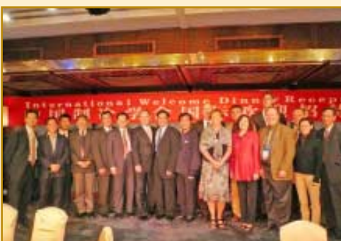
April 4-6, 2007: Participated in China Refrigeration 2007 at CECF Pazhou Complex, Guangzhou, China.