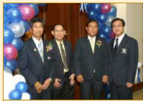
November 17, 2006: Participated in the annual meeting of Air-Conditioning Engineering Association of Thailand at The Grand Hotel.