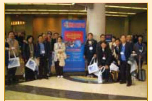
January 28 to February 3, 2007: Visited the 2007 AHR Expo at the Dallas Convention Center in Dallas, TX, USA.