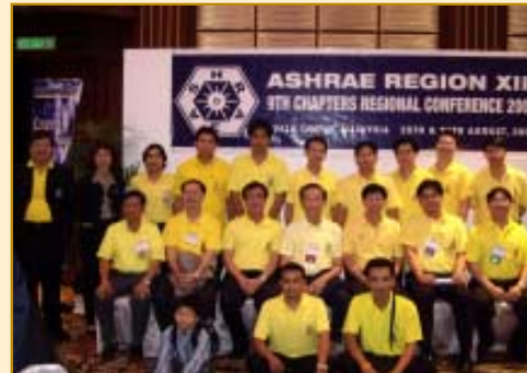
August 25-26, 2006: Attended in ASHRAE Region XIII 9 th CRC 2006 at Sunway Lagoon Hotel Resort, Malaysia.