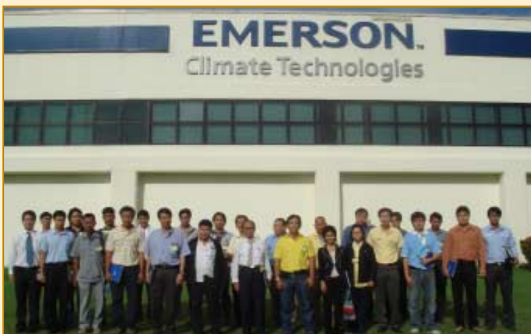
June 14, 2007: Organized Factory visit compressor factory at "Emerson Climate Technology Factory".