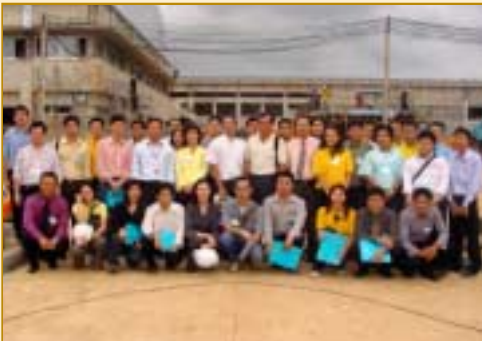
July 4, 2006: ASHRAE Thailand Chapter had set activity visited site at Thai Mint factory II, Bank of Thailand.