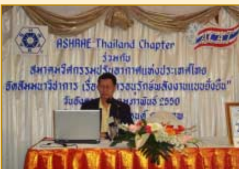
February 6, 2007: Seminar on Topic "Sustainability and energy conservation" at The Grand Hotel, Chao Sam Pra-ya room.