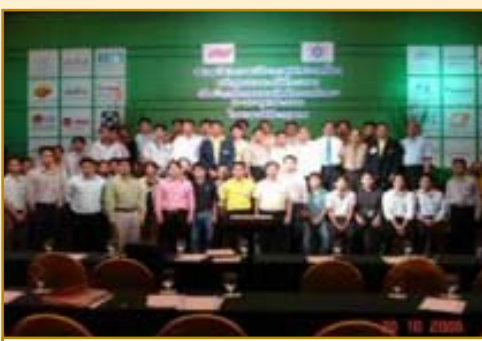
October 11-12, 2006: Training topic "COMMERCIAL REFRIGERATION COLD ROOM DESIGN FROM BEGINNING UNTIL THE END" at the Grand Hotel, Chao Sam Pra-ya room.