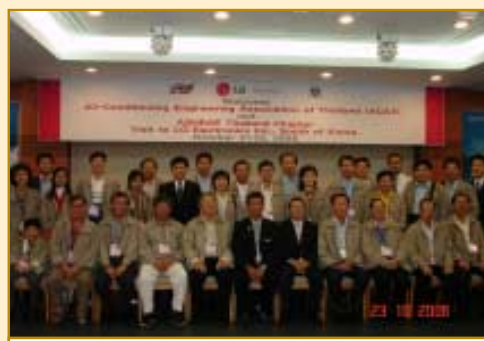
October 22-25, 2006: L.G Electronics invite to visit factory in Korea.