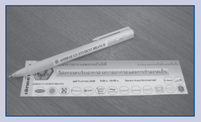
An inviting card and a gift for visitors.