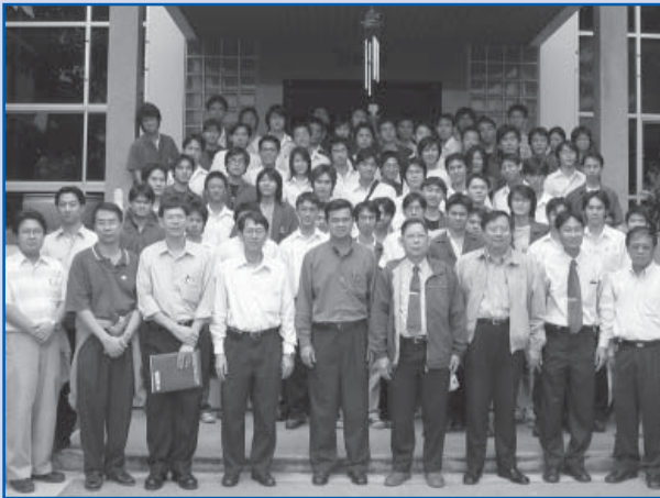
➔ Student, Staff and Managing Team of Patkol Public Company Ltd took a photograph together in front of Patkol's Food and Refrigeration Equipment Fabrication Factory.

To encourage the student to understand more on the Refrigeration Project Category, ASHRAE Thailand Chapter, Patkol Public Company Limited and Mechanical Engineering Department at Chulalongkorn University arranged a Technical Tour for a group of approximately 75 students to visit Cold Storage Distribution Center of VM Food Co. Ltd. and Patkol's Refrigeration and Food Processing Equipment Fabrication Shop on the 11 th of September 2004. Representative from ASHRAE Thailand Chapter also gave a lecture to a group of on the Fundamental of Designing Cold Storage Distribution Center so that student would understand more on the actual design issues before start working on the Student Design Project Competition 2005.