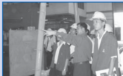
➔ Patkol's Factory Manager was explaining to a student visiting the Factory.