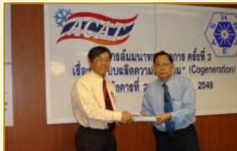
Nov 22, 2005: ASHRAE (THAILAND) organized the technical seminar on "Co-Generation plant" at EIT Seminar Room, BKK.