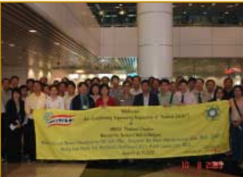
Aug 10-13, 2005: Technical Visiting at Nicotra plants, AAF Filters, OYL R&D Centre, Co-Generation Plant and District Cooling System at KLIA, MALAYSIA.