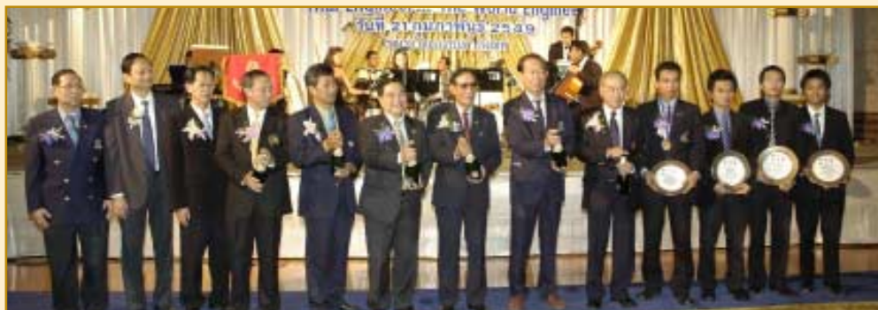
Feb 21, 2006: ASHRAE (THAILAND) co-organized with ACAT, TRA, FDI, TEMCA & MECT to honor and celebrate to the distinguished Thai Engineers who were recognized & reputed in worldwide at the Grand Hotel, BKK on the theme of "Thai Engineer the world Engineer".