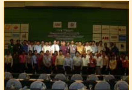
Oct 13-14, 2005: Organized the technical training on "The air-conditioning system design to control the infection and humidity in the hospital" at Radison Hotel, BKK.