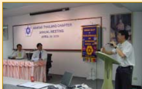
Apr 26, 2006: ASHRAE (THAILAND) held the annual Conference to vote for the new official BOGS & Committee chairs year 2006-2007 and sponsors appreciation presentation.