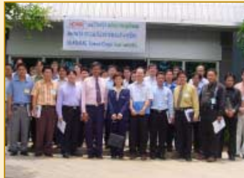
Sep 6, 2005: Technical Visiting at Toshiba (Carrier) Factory and C.I. Group Factory.