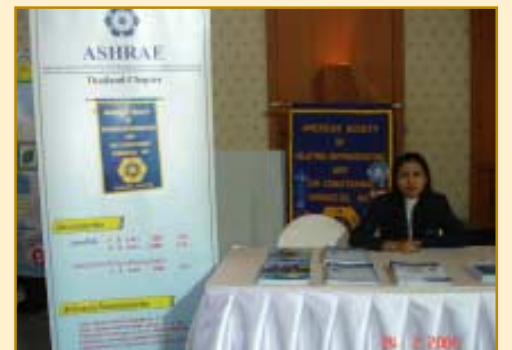
Feb 24, 2006: Joined in "Carrier Journey with the experts" fair by Carries (Thailand) at Maung thong thani, BKK. to promote & PR ASHRAE (THAILAND).