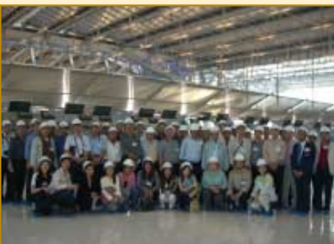
Dec 26, 2005: Technical Visiting to the Suvarnabhumi International Air port BKK.